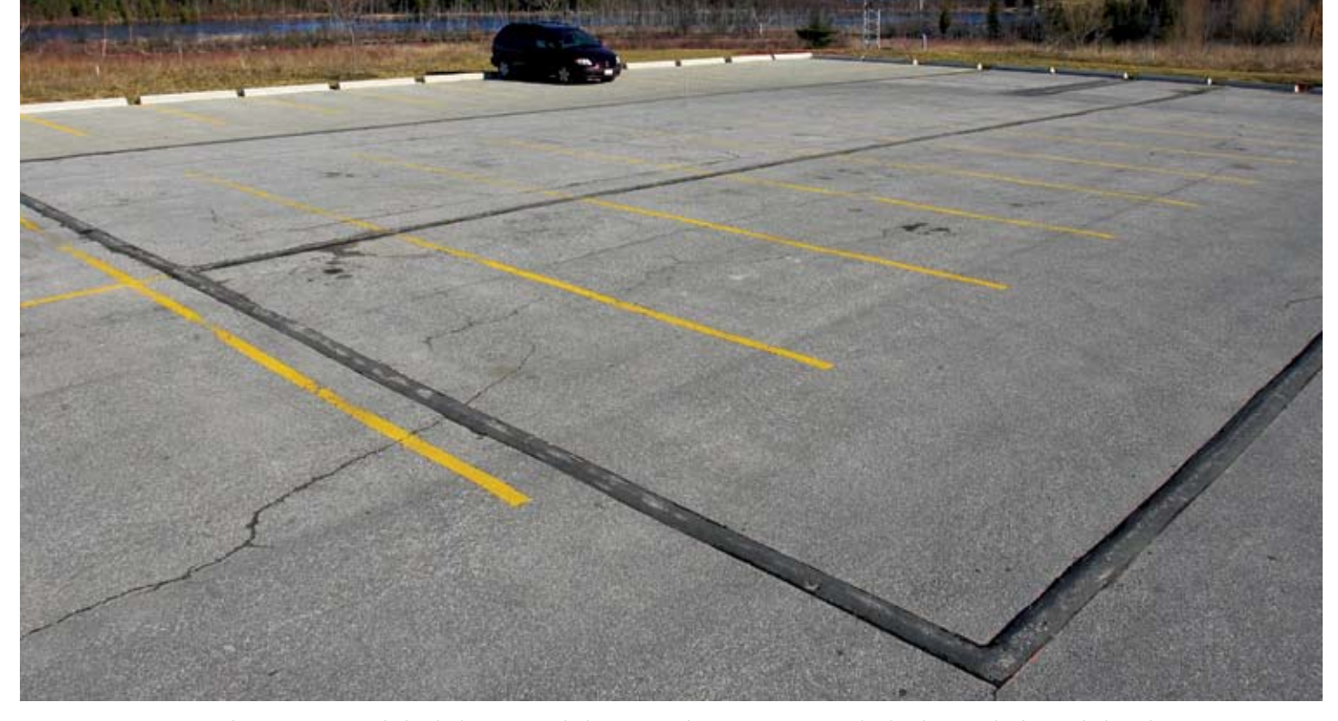
Figure 2. The test area is subdivided in two asphalt areas and one PICP area in the background. The asphalt curbs separate the runoff from each area.

mm) of open-graded aggregate supporting 3<sup>1</sup>/<sub>8</sub> in. (80 mm) thick permeable interlocking concrete pavers. Beneath this base is a subbase of 12 in. (300 mm) thick compacted, dense-graded aggregate, Ontario Granular A, a base material typically used under asphalt roads and parking lots. Figure 3 shows the PICP cross section. While PICP construction typically uses thicker open-graded aggregate bases without compacted, dense-graded bases under them, this experiment was designed to capture and analyze much of the runoff in the opengraded layer in order to assess its pollution reduction effectiveness.